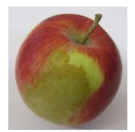
External CO<sub>2</sub> injury in 'Empire' apple