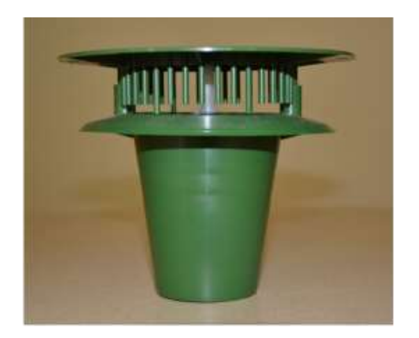
Figure 1. New Vernon Beetle Pitfall trap