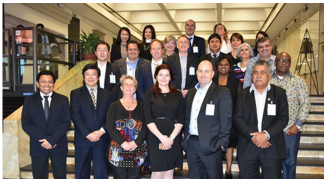
The new IPPC-IC.