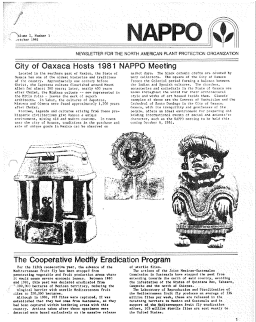
The first NAPPO Newsletter.

The NAPPO newsletter is published three times a year – March, July and November. We hope we can continue publishing the NAPPO newsletter for many years to come.