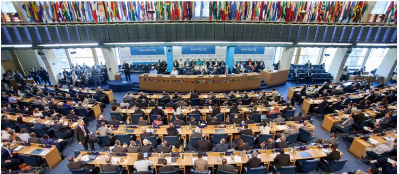
CPM plenary.

In line with the 2018 theme year for the IPPC – Plant Health and Environmental Protection – the Commission on Biological Diversity (CBD) will deliver a keynote address on this subject at CPM-13. Furthermore, CPM-13 will have side sessions on next generation sequencing and on research collaboration .